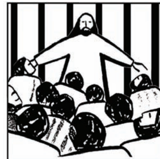
ST. FRANCIS DE SALES

"Today this Scripture has been fulfilled in your hearing."